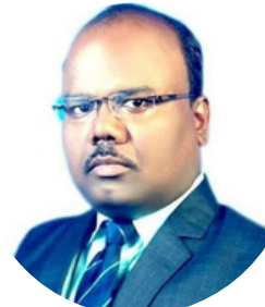
DR. SHIVJEE PRASAD CHANAKYA NATIONAL LAW UNIVERSITY, PATNA